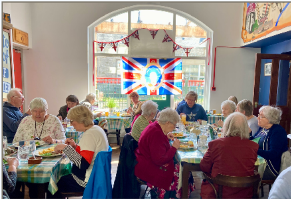
Home cooked food at 'Brief Encounter' Bistro, Carnforth