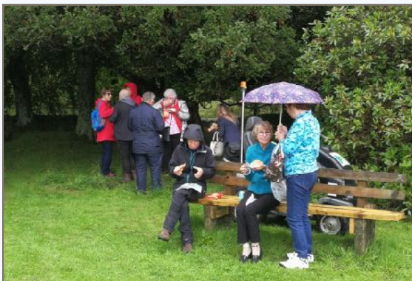
A picnic before exploring the Birch Hills Trail at Stocks Reservoir