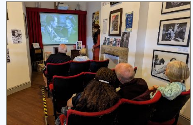
Viewing a 'Brief Encounter' at Carnforth Heritage Centre