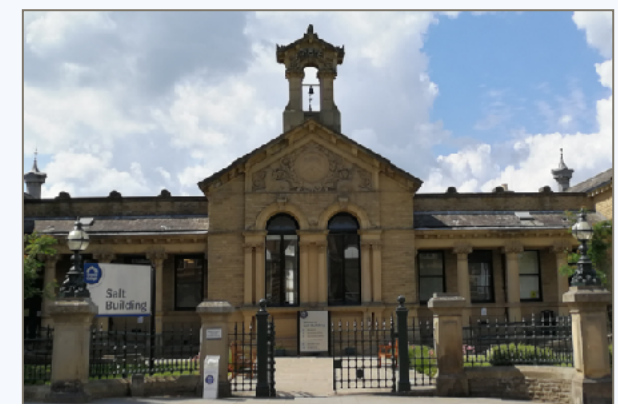
Visiting the famous Salts Mill and Victoria Hall, Saltaire