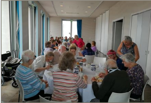
Afternoon tea at the Midland Hotel, Morecambe