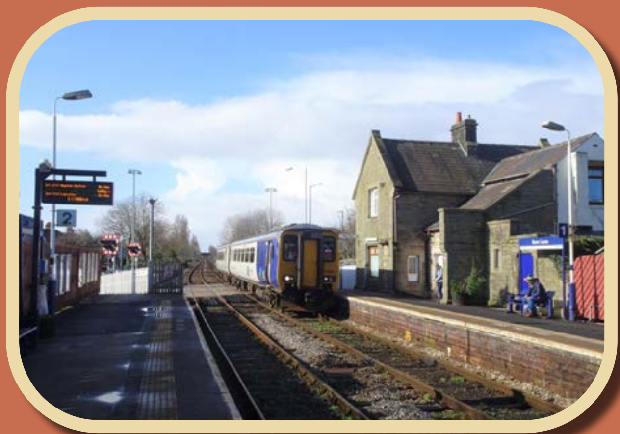
156452 arrives at Bare Lane station on its short journey to Lancaster, in 2020.