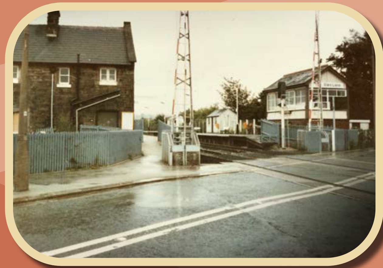
View of station and signal box in 1980. The former hand-operated crossing gates have been replaced by electric barriers and colour-light signals have superseded the earlier semaphores.