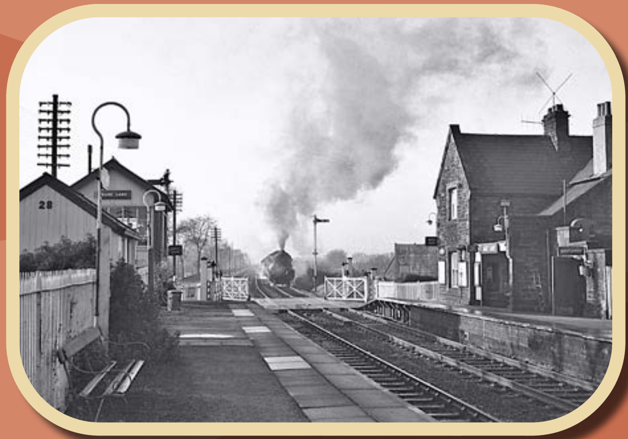
A steam-hauled freight stands at the signal as the level crossing gates are closed to road traffic, in the 1960's.