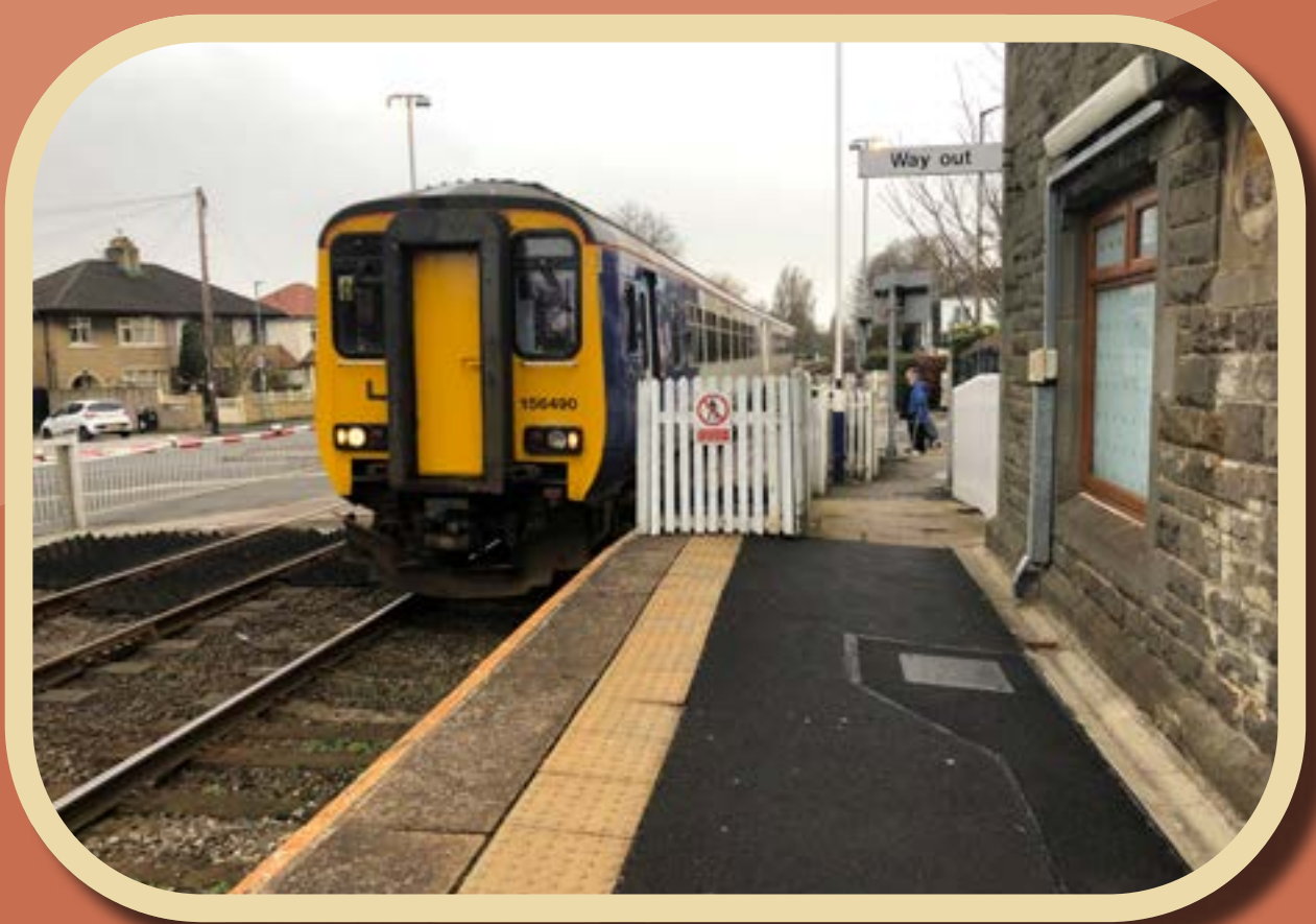
A Class 156 rolls into Bare Lane station in April 2019, with a local service from Morecambe to Lancaster.