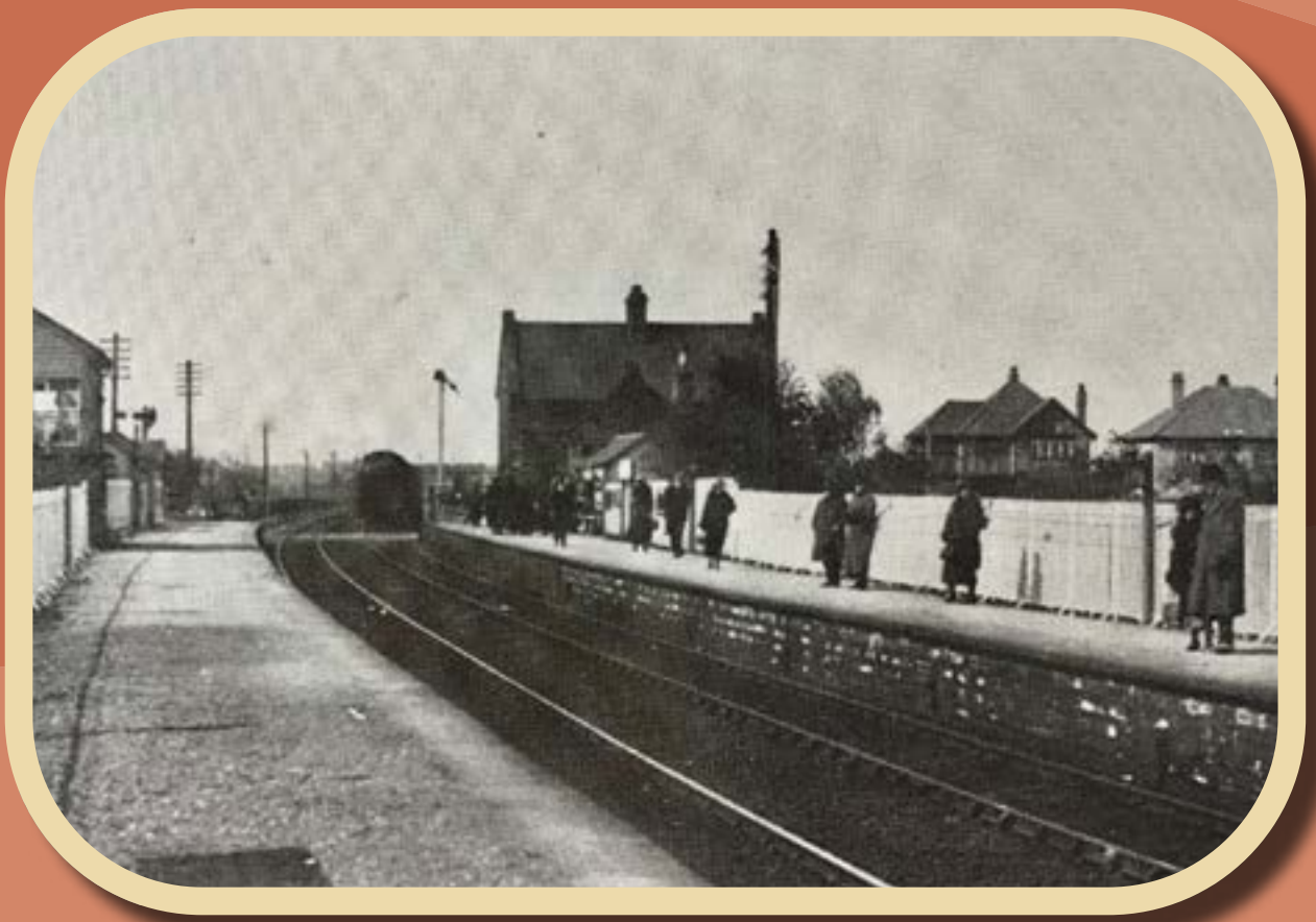
An early photograph of Bare Lane station looking towards Morecambe. Photographer not known.