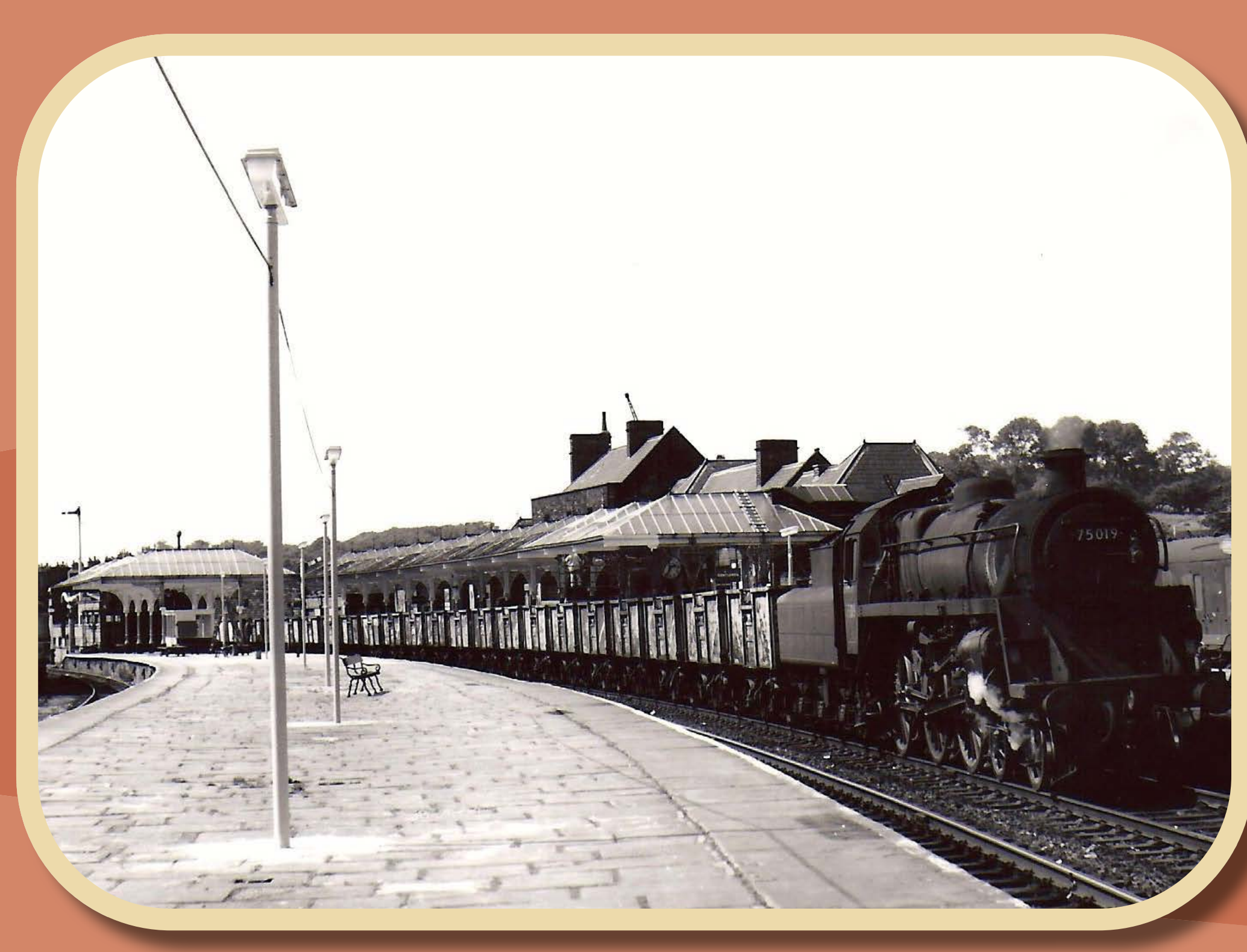
A standard 4MT 75019 heads a mineral train through Skipton in the early 1960's.