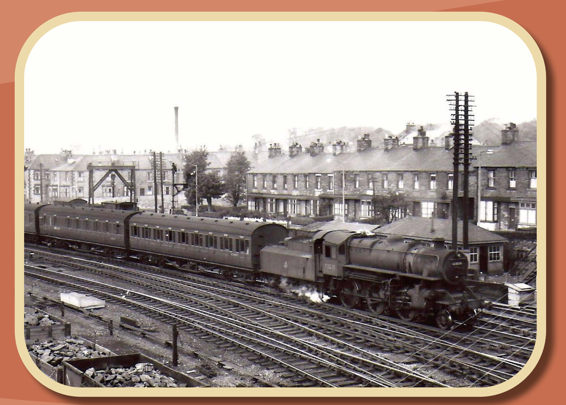
An Ivatt 4MT 2-6-0 locomotive approaches Skipton during the early 1960's.