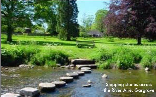
Stepping stones across the River Aire, Gargrave

This leaflet describes one of a diverse collection of twelve walks linking neighbouring stations along the Bentham Line between Heysham Port and Skipton.