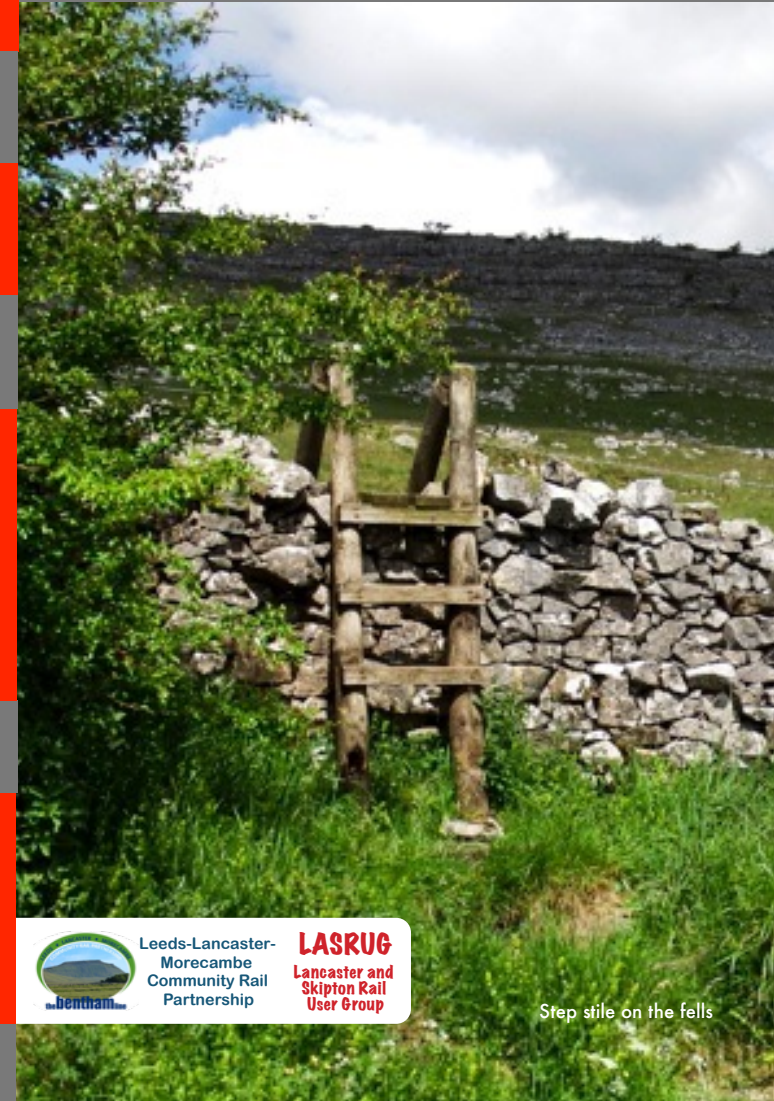
Step stile on the fells